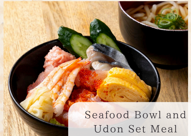
Seafood Bowl and Udon Set Meal