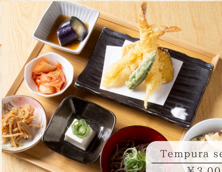
Tempura set menu

We will customize according to your budget and requirements