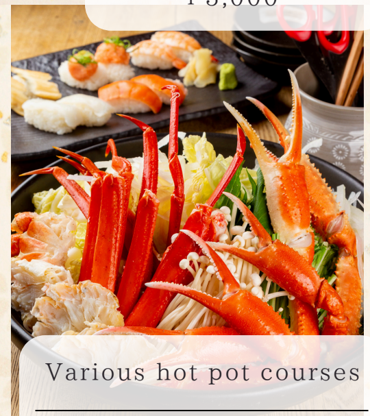
Various hot pot courses